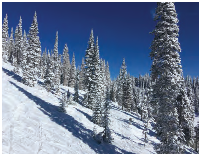
Slope beside SunBurst Chairlift, Sun Peaks Canada