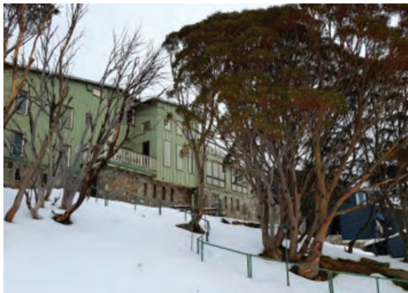
The Lodge at Charlotte Pass, ready for the season