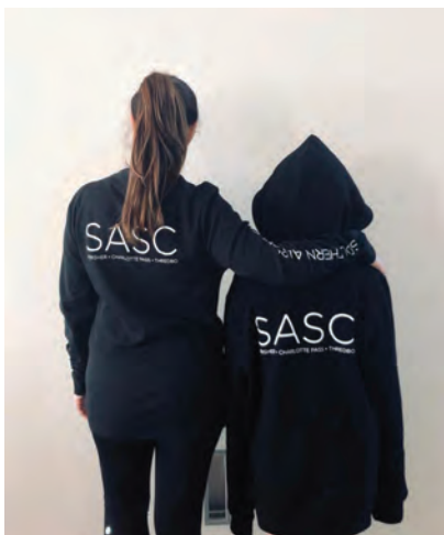
SASC hoodie and shirt