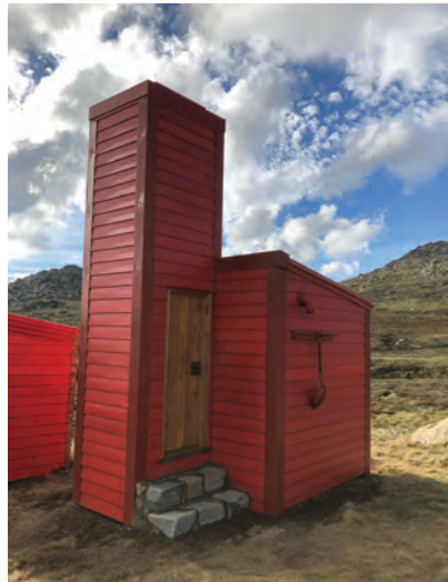
New Cootapatamba Hut

We met near De Burghs Bridge and completed a circuit of the Lane Cove River from the bridge to the weir and back, a fabulous 10km walk with a mixture of flat bits, steep bits, rock scrambles and even a coffee shop for lunch. Thanks to Sharon, Chris and Harm.