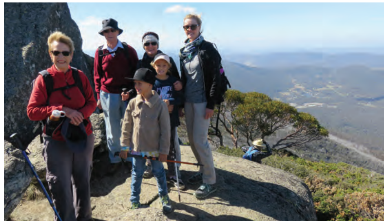
At the Porcupine Lookout

We look forward to seeing you on a walk soon. Please go to our SASC website for more walk photos.