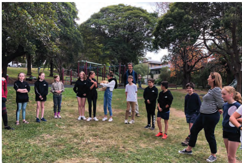
Warming up for bus trip at the BBQ