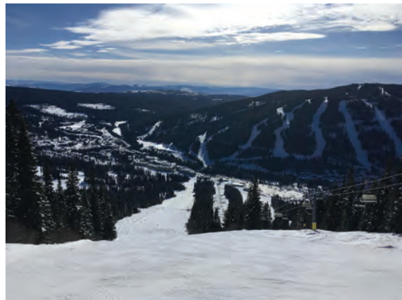
Looking down on Sun Peaks from Sunburst chairlift slope