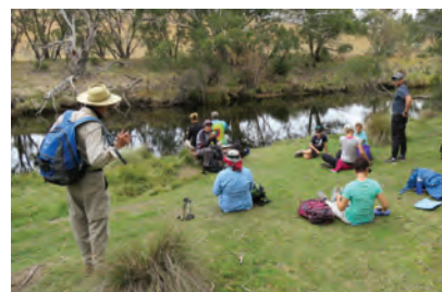
On the Thredbo River

BREP is only 120 km from Sydney at 774 Jamberoo Mountain Road. Cabin accommodation is very reasonable. To take advantage of reduced rates for SASC members a password must be used with your booking – please contact Rod Peile 0448 670 586. There is always work to be done on the preserve, working bees are planned for May 12/13, Aug 4/5, Nov 4/5. See www.benricketts.org.au