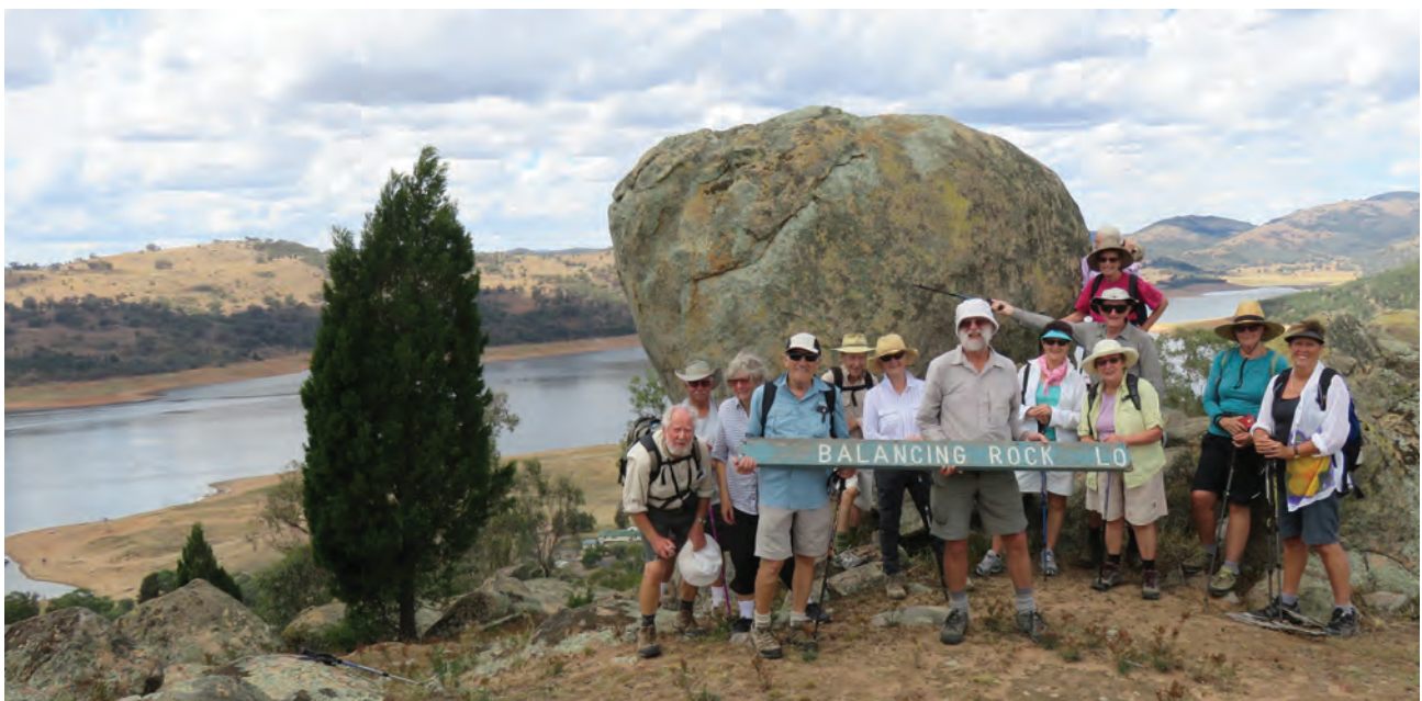
Balancing Rock Lookout at Wyangala