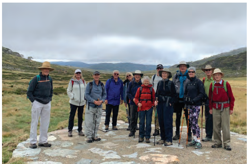
Charlotte Pass to Perisher