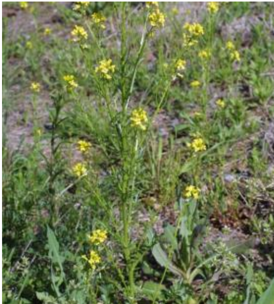
Early Wintercress ( Barbarea verna )