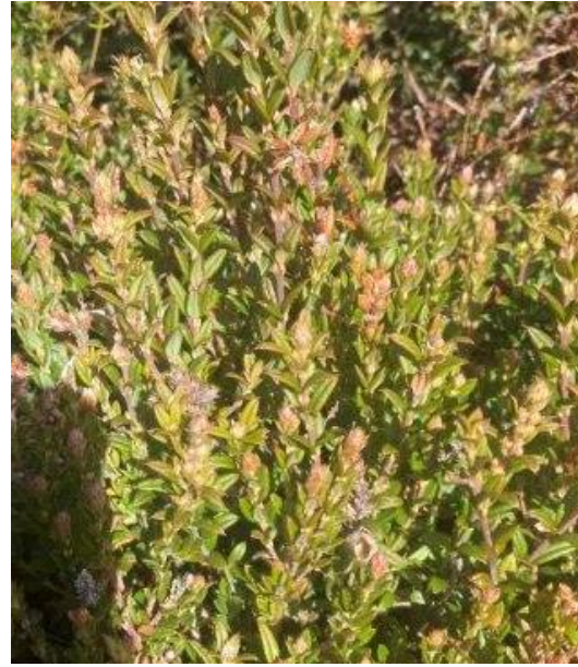
Alpine Shaggy Pea ( Podolobium alpestre )