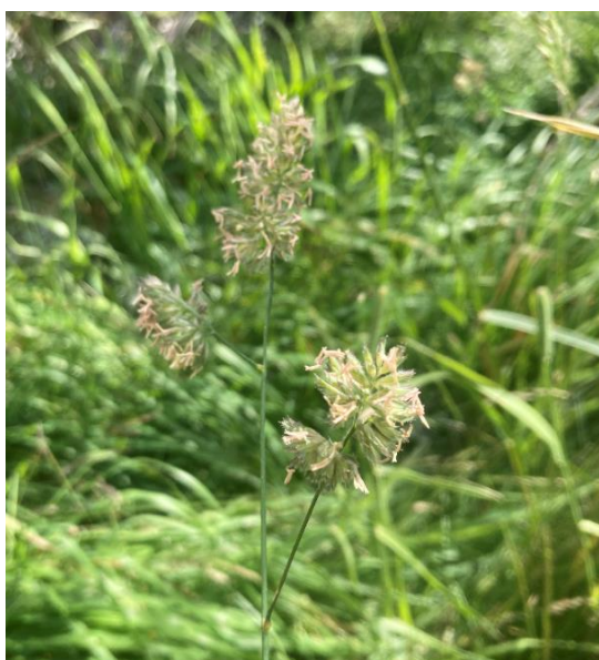
Cocksfoot ( Dactylis glomerata )