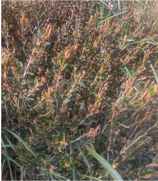
Alpine Hovea ( Hovea montana )