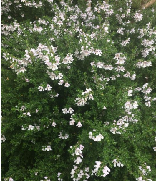
Mint Bush ( Prostanthera cuneata )