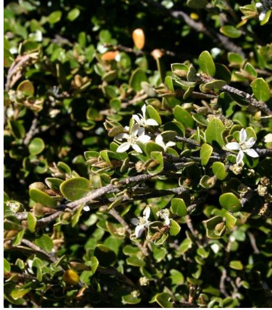
Ovate Phebalium ( Nematolepis ovatifolia )