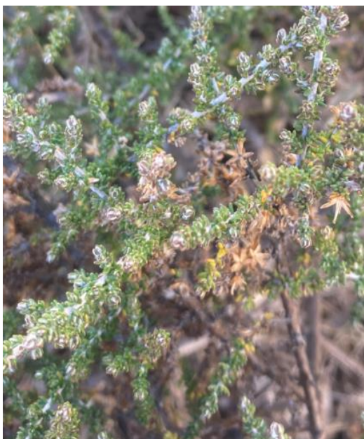
To be determined