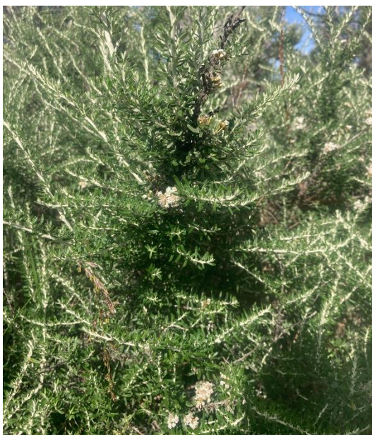
Alpine Everlasting ( Ozothamnus alpinus )