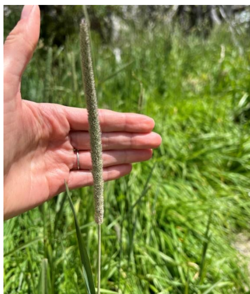
Timothy Grass ( Phleum pratense )