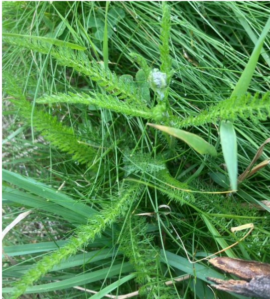
Yarrow/Milfoil ( Achillea millefolium )