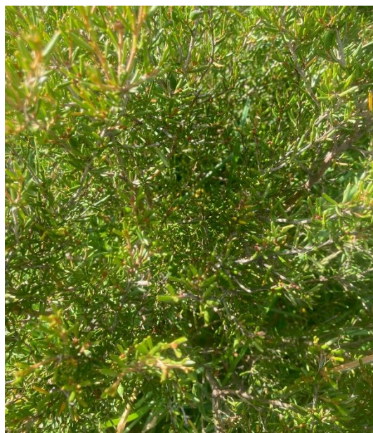
Alpine Grevillea ( Grevillea australis )