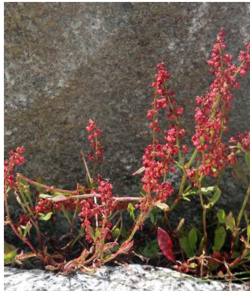
Sheep Sorrel ( Acetosella vulgaris )