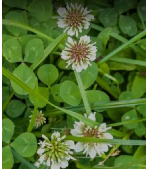
Clover ( Trifolium spp)